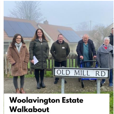
Woolavington Estate Walkabout