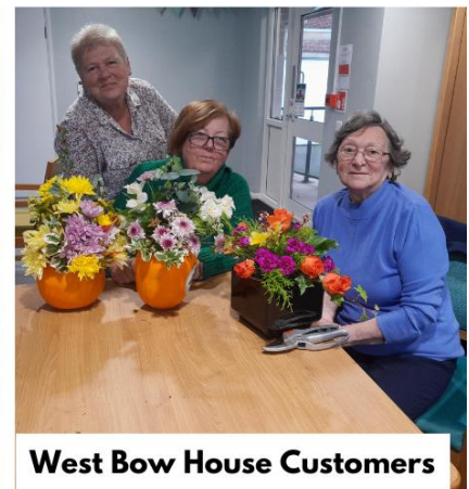
West Bow House Customers