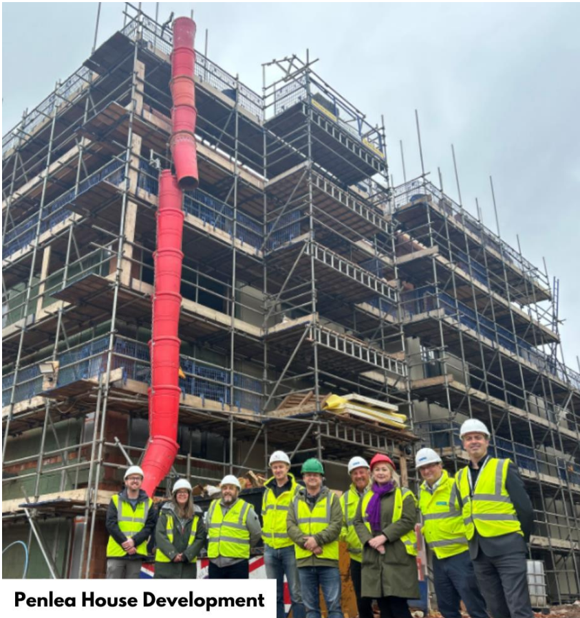
Penlea House Development