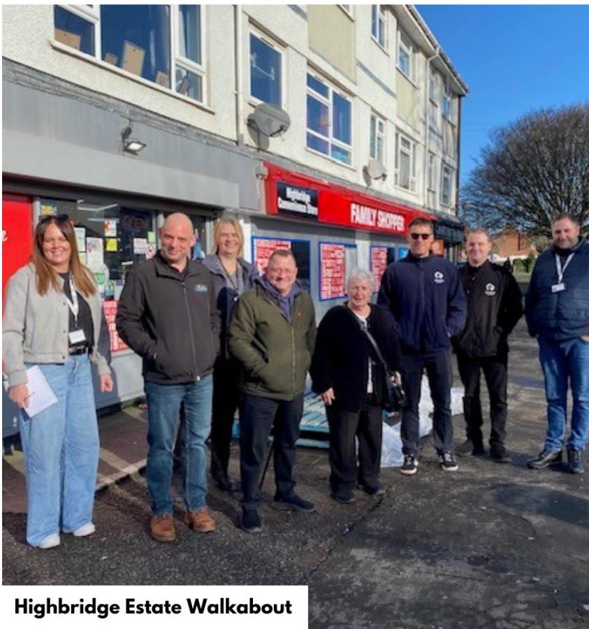
Highbridge Estate Walkabout