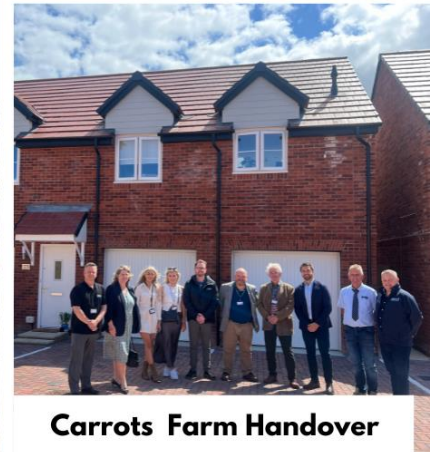
Carrots Farm Handover