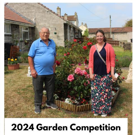
2024 Garden Competition